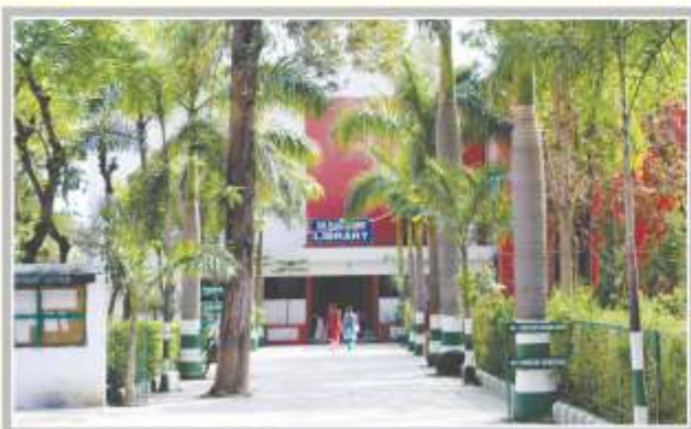
DR. RAM SINGH LIBRARY