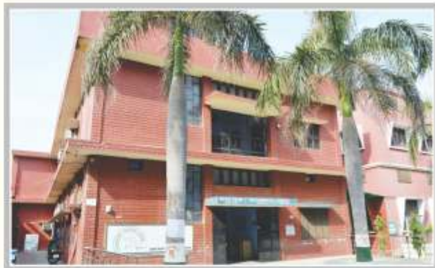
REGISTRAR, ACCOUNTS & NAAC OFFICE