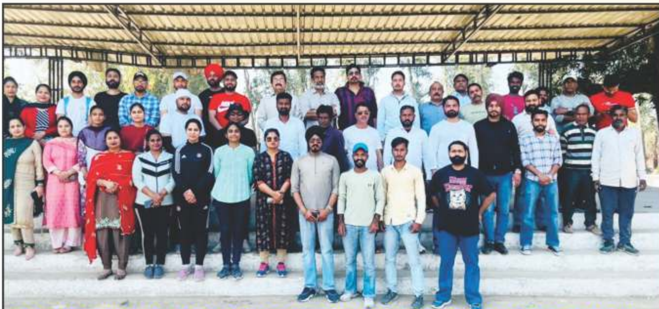
TEACHING & NON-TEACHING STAFF (CRICKET TEAM)