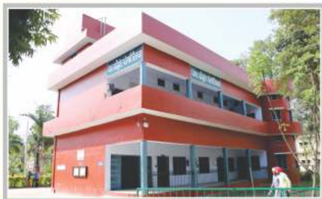
PG DEPARTMENT OF PUNJABI