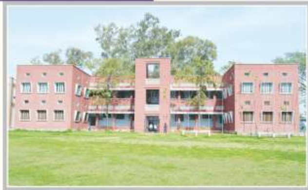
PHYSICS & COMMERCE BLOCK